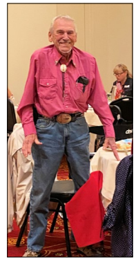
Oldest veteran 93