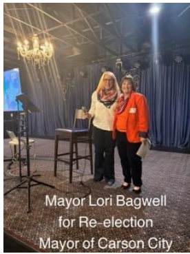
Mayor Lori Bagwell for Re-election Mayor of Carson City