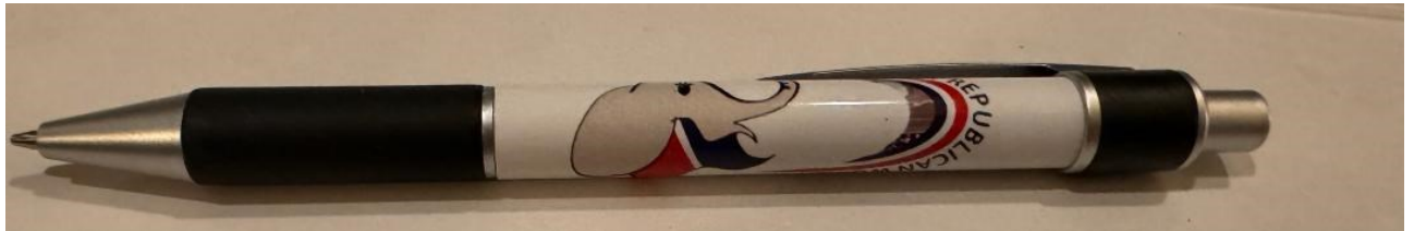
CCRW Writing Pen $2

CCRW Boutique is now open—many fun items, books and baked goods available