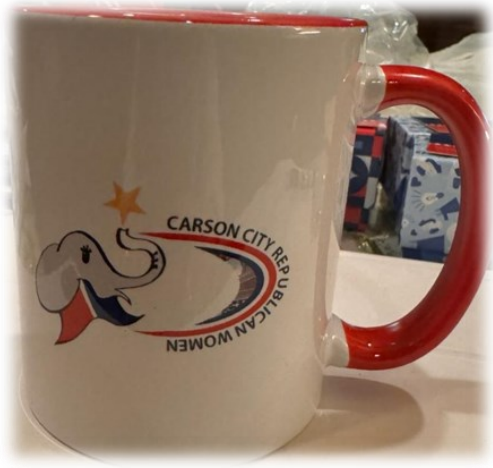
CCRW Coffee Mug $15